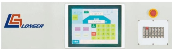
15 inch touch screen as option on size 1150 up