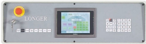
8.4 inch touch screen for 660 to 1060 model