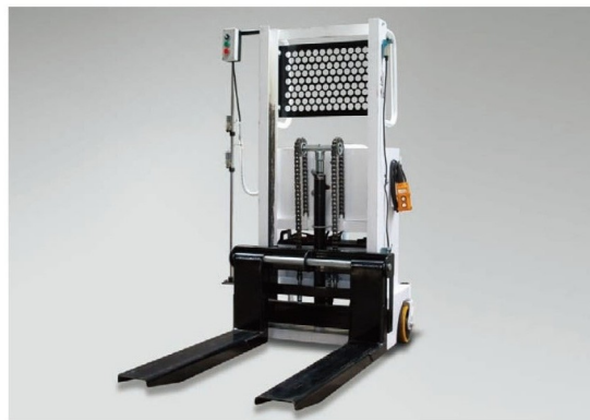
Free standing paper lifter / Capacity: 1000kgs