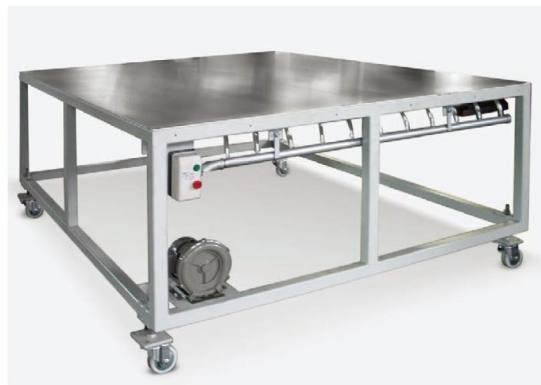
Air working tables: