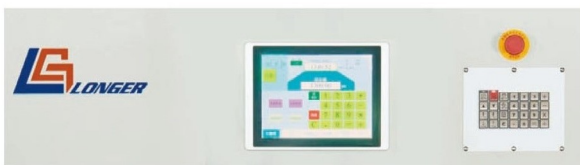
10.4 inch touch screen standard on size 1150 up