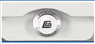
電子式手動微調開關 Electromagnetic hand wheel for fine tuning