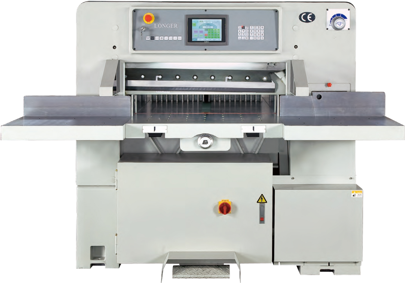
機械尺寸 (Machine Dimensions)