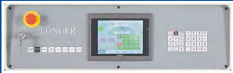
8.4吋觸控螢幕 8.4 inch touch screen