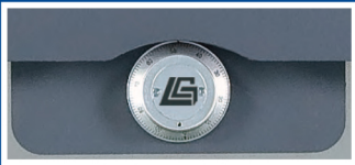
電子式手動微調開關 Electromagnetic hand wheel for fine tuning