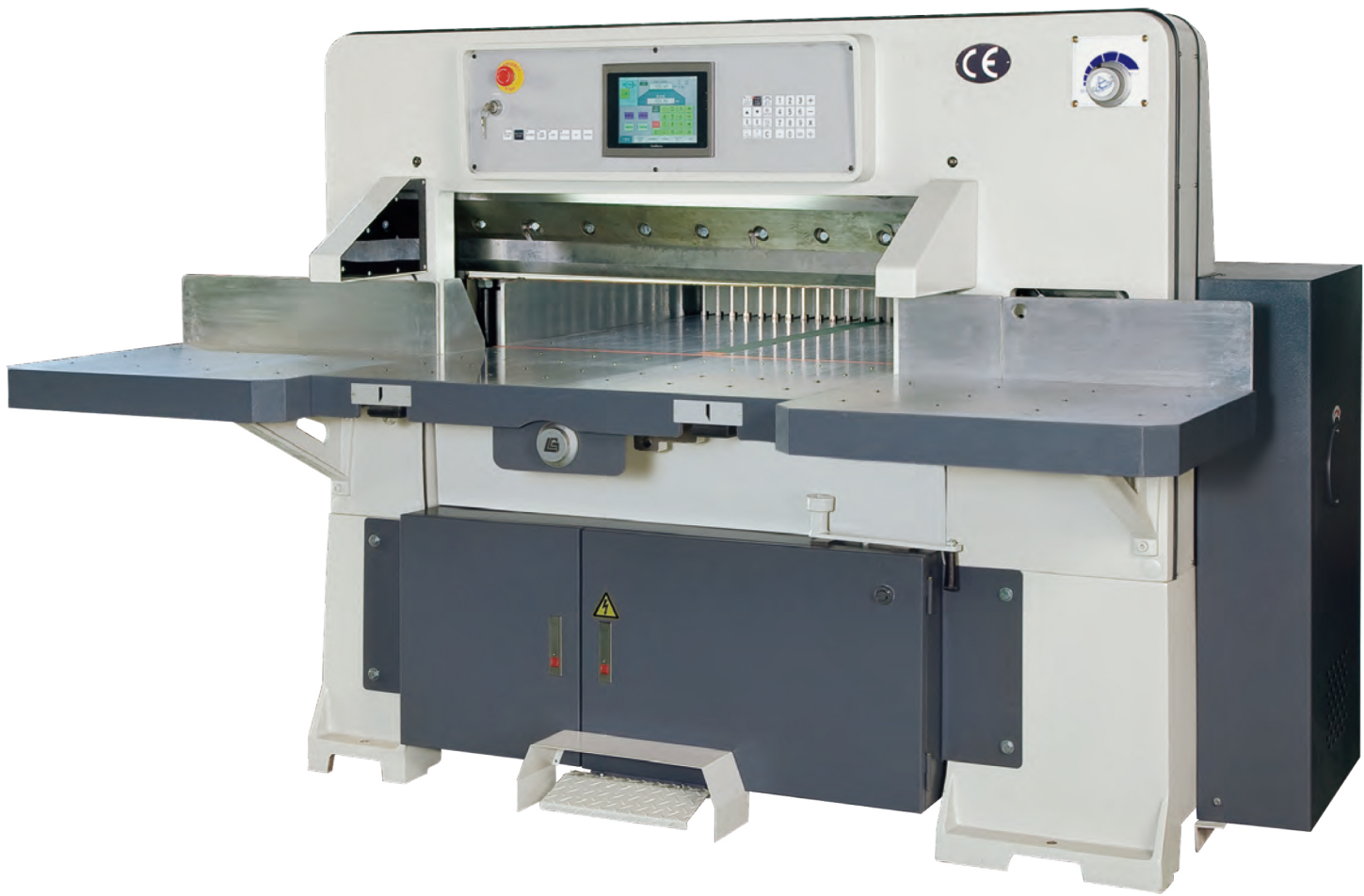
機械尺寸 (Machine Dimensions)